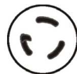
Nema L6-30 Twist